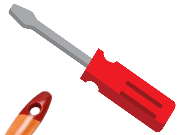
Partnering with other churches

SEBA are also partnering with a range of other organisations who are have a range of resources supporting churches in their mission. These include, LICC, Everyone Everywhere, Share Jesus International, The Rooftop & BMS.